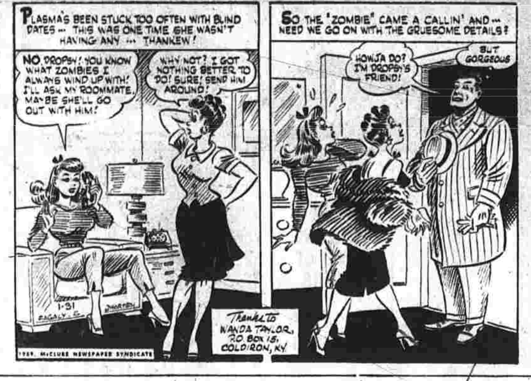
PLASMAS BEING STUCK TOGETHER WITH BAND-AIDS... SO THE 'ZOMBIES' CAME A CALLING... WE'VE GOT TO DO SOMETHING TO STOP THEM FROM GETTING TOGETHER.